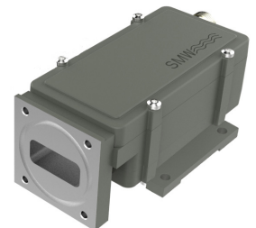
Optional enclosure fixing points

Available with Internal LO ref. or with External 10 MHz ref. input.