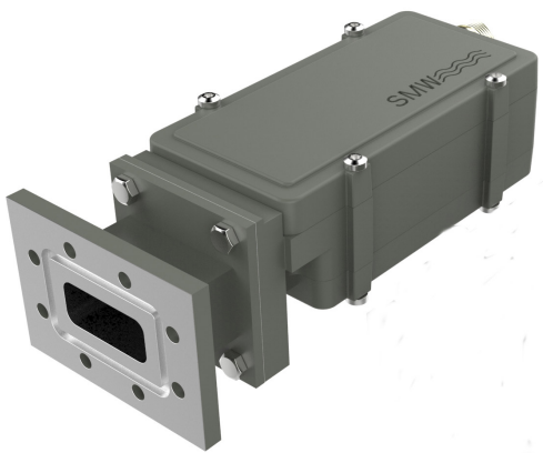
With optional CPR 112G adapter